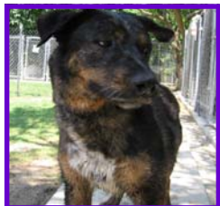
Homer, ready for a play date