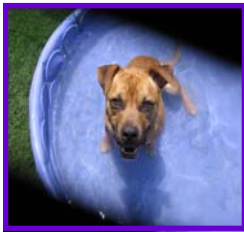
Apollo, looking for a friend who also loves the water