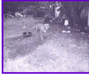
Living in horrible conditions chained to a tree