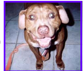
Prankster will melt your heart with his big eyes and sloppy doggie kisses!