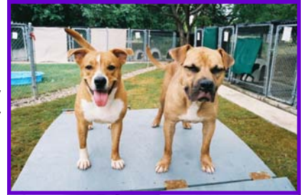
The happy couple—Xena and Apollo taking an afternoon stroll

This darling duo was found looking for love in an industrial area of Dallas. Two caring ladies, concerned for their safety contacted Lexee's Legacy and Voila; we had a suite waiting for them at our shelter.