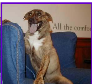
Blaze, a handsome boy, has his own Guardian Angel but many of his friends need their own Guardian Angel

If you are not in a position to adopt, please consider sponsoring one or more of our orphan dogs. You will be helping to save lives and we will send you a package of information on your sponsored animals along with a signed photo!! Yes, we will have them put their paw of approval on their picture.