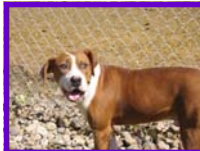
Trooper, "so, ya gonna throw that ball or not?"

Trooper is eagerly awaiting his New Beginning!